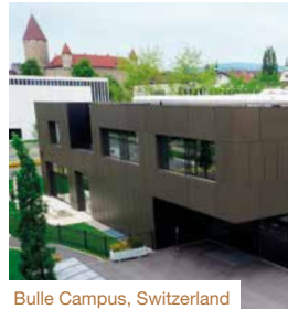
Bulle Campus, Switzerland

Route de Glion 111 1823 Glion-sur-Montreux